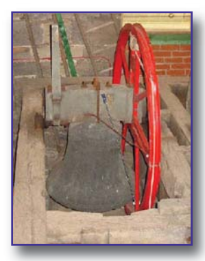
One of the current bells

For many centuries, church bells have rung out over Stone from the tower of St Michael and St Wulfads' church. Six of the bells date back to 1710 and the wooden frame on which they hang is probably much older. Although they are old, the bells were never made to be together as a "ring" and are now, because of wear, needing to be replaced.