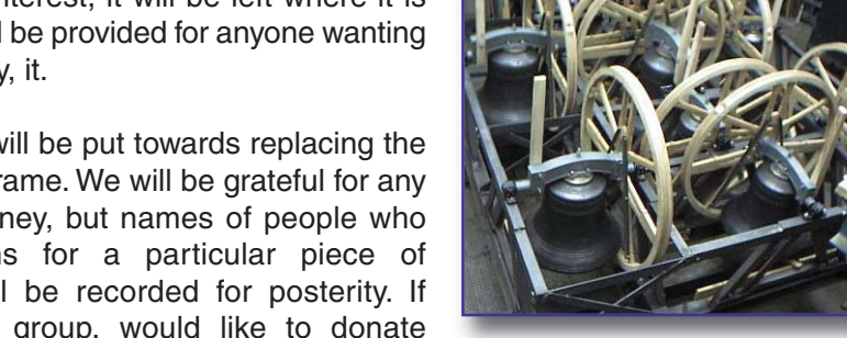
A new "ring" in a metal frame

All donations will be put towards replacing the bells and the frame. We will be grateful for any amount of money, but names of people who give donations for a particular piece of equipment will be recorded for posterity. If anyone, or a group, would like to donate enough for a bell, a suitable inscription will be