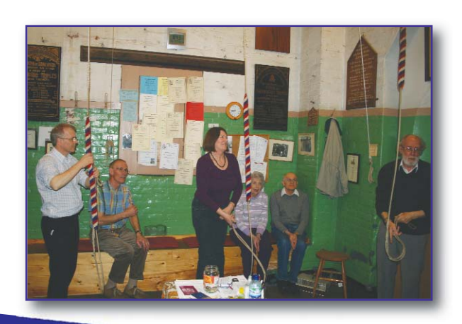
Some of the Stone Ringers at their regular Thursday practise